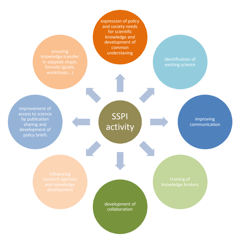
Figure 2: Major roles of a science-society-policy interface

Often a knowledge broker (who could be either an individual or an organization) is a major actor of this interface: he will energize, conduct and facilitate the process summarized in figure 1. Knowledge brokers are (either an individual or an organization) skilled experts dedicated, trained, and resourced to engage in the SSPI. They are facilitators and relay people. Their specific role is to assist policy makers in the formulation of scientific and technical questions, to enhance the scientific knowledge transfer to the policy makers and to contribute to keep research aligned with policy needs and adjust research to evolving policy if needed.